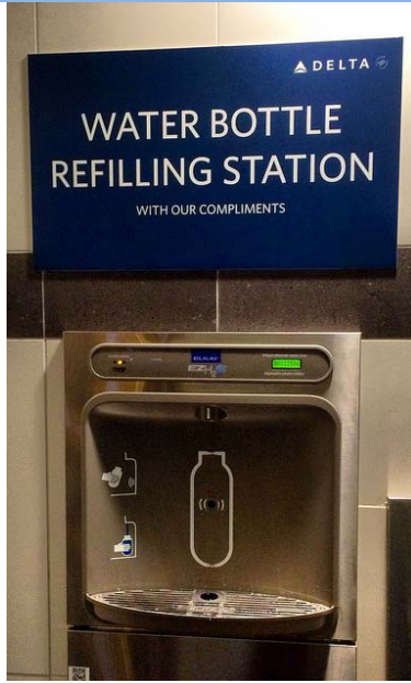
Water Refill Station at LaGuardia