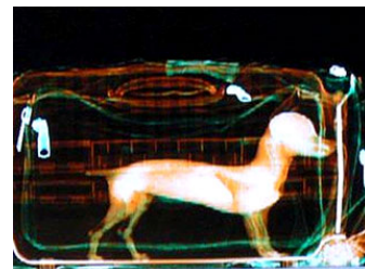
Does traveling without your pet give you separation anxiety?

Airports without: Atlanta Hartsfield-Jackson, Boston Logan, Charlotte Douglas, Chicago O'Hare, Dallas/Fort Worth, Denver, George Bush Intercontinental, John F. Kennedy, LaGuardia, McCarran, Miami, Newark Liberty, Orlando, Philadelphia, Phoenix Sky Harbor, San Francisco (16).