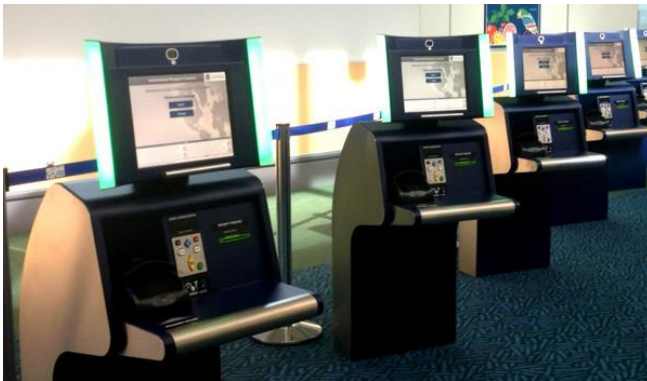
Automated Passport Control Kiosks