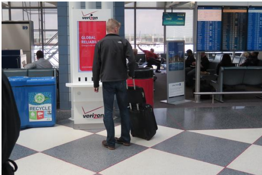
An interactive charging kiosk at Chicago O'Hare Chicago Business Journal

Sure, your standard plug is sometimes just what's needed, but some airports are looking to the future.