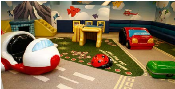
Sea-Tac's aviation-inspired children's play area