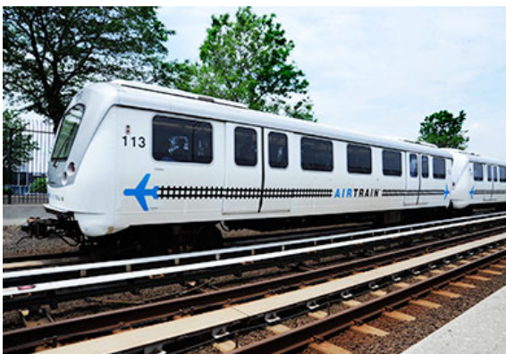
The AirTrain at JFK The Business Travel Magazine

Navigating a new and unfamiliar airport can be both confusing and tiring, which is why many airports have invested heavily in their intra-airport transportation systems, ranging from trams to shuttles and railways to help passengers travel between terminals and concourses.