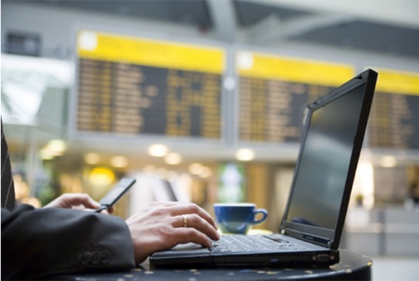
Passenger working remotely at the airport