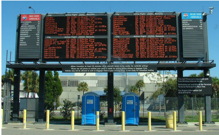
Cell Phone Lot at Tampa Airport