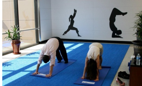
Yoga Studio at Dallas/Fort Worth

Most notably, yoga facilities are on the rise and are now available at Chicago O'Hare, Dallas/Fort Worth and San Francisco. This spike in popularity is unsurprising as yoga studios enable fliers to keep up with their fitness routine, but also provide a peaceful place to relax before a flight.