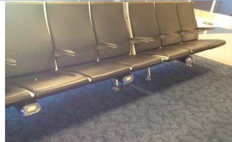
Seats outfitted with electrical sockets at LaGuardia Blog.TMC.net

Most large international airports offer passengers numerous outlets and charging stations – on average, US airports have 5.5 outlets per gate. JFK, however, has an average of 8.5 electrical outlets per gate, second only to the tech friendly city of San Francisco which had an average of 13.6.