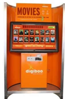
A Digiboo Kiosk

Airports without: Atlanta Hartsfield-Jackson, Boston Logan, Charlotte Douglas, Chicago O'Hare, Dallas/Fort Worth, Denver, Detroit Metropolitan, John F. Kennedy, LaGuardia, Los Angeles, McCarran, Miami, Newark Liberty, Orlando, Philadelphia, Phoenix Sky Harbor, San Francisco (17).